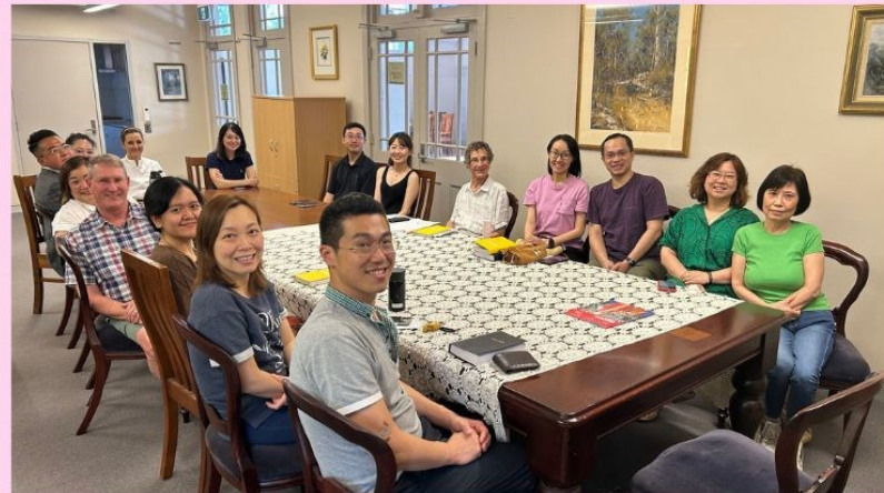
Last Saturday afternoon our RCIA catechumens and team members gathered for their last meeting before the new year. Please keep those preparing to join our family of faith through baptism in your prayers.

We have now set up a special section of our parish website (www.lindfieldkillara.org.au) which can be accessed via one of the hotlink boxes on the homepage. It provides some introductory insight into the Jubilee and how it can be part of our lives and discipleship. The page will continue to evolve. Please visit it often.